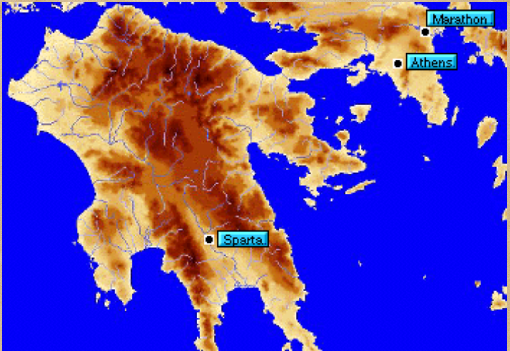
Battle of Marathon