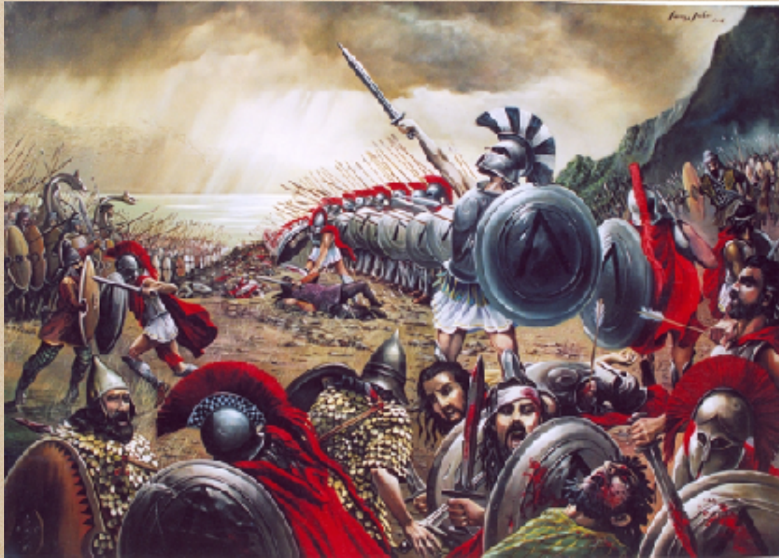
Battle of Thermopylae 480 BC