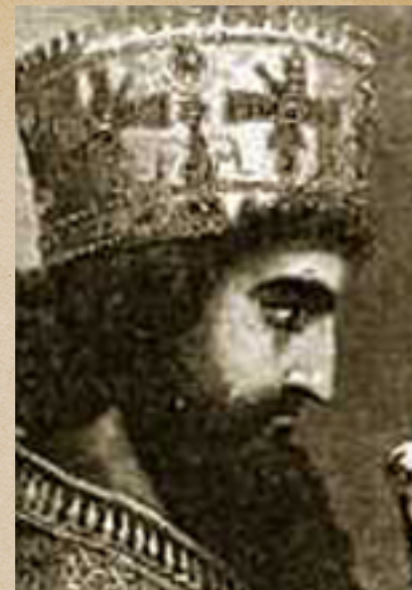
Xerxes 518-465 BC