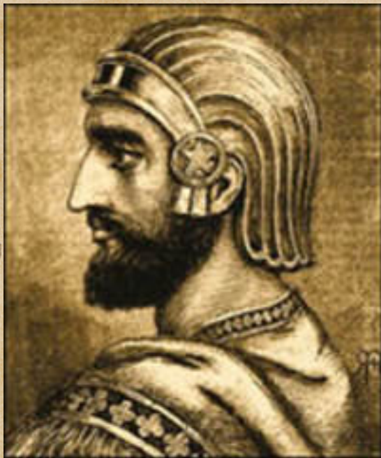
Cyrus 600-576 BC