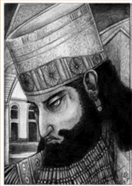
Darius 550-486 BC